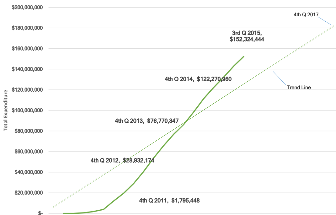
Graph 1: HomeSafe Georgia, Total Expenditures over Time

DCA must average $20.7 million in expenditures for nine (9) consecutive quarters (from the 4th quarter of 2015 through the end of 2017) to use Georgia's total allocation; the largest expenditure to date has been $13.2 million during the second quarter of 2013.